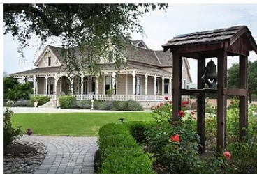
Morgan Hill House