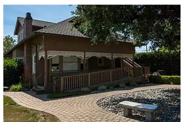
Morgan Hill Museum

In 2002, our branch formed a partnership with the MH Historical Society that has been a great success for both organizations. Our board agreed that in exchange for providing at least two docents monthly for the Morgan Hill House and the Museum we would be able to hold branch events at the MH House at no charge to our branch.