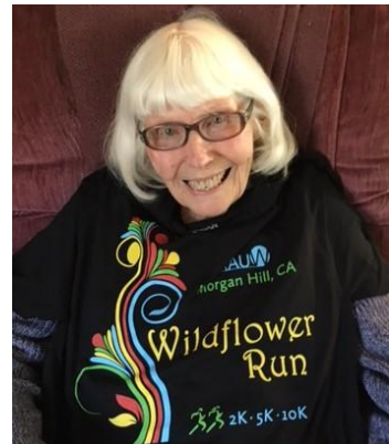
2016 Wildflower Run t-shirt